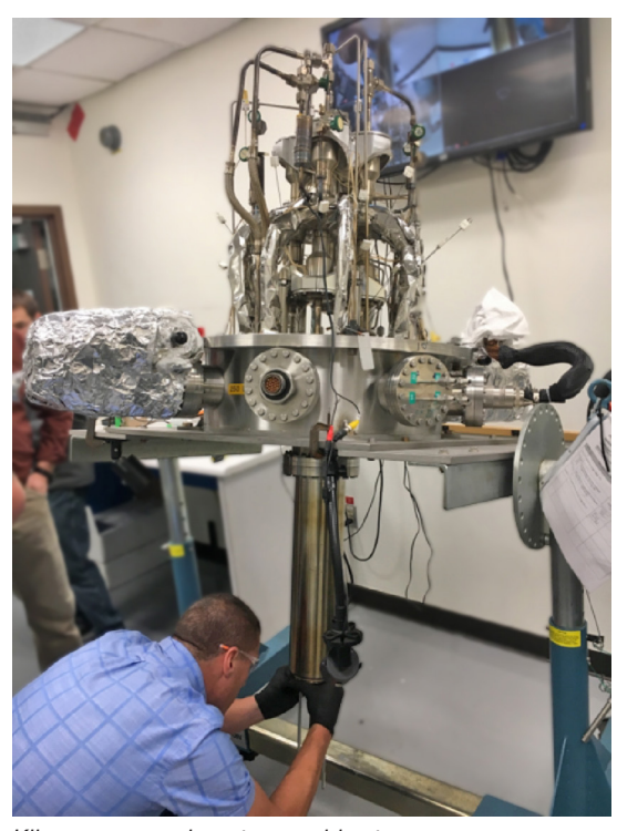
Kilopower experiment assembly at NASA's Glenn Research Center.

Because of fission power's great potential for space exploration, the NASA Space Technology Mission Directorate's Game Changing Development (GCD) Program is funding the